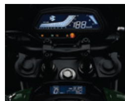
DUA PAPARAN LCD / REVERSE LCD DUAL CONSOLE