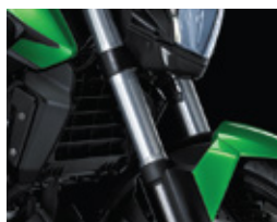
SUSPENSI HADAPAN 'UPSIDE DOWN' / UPSIDE DOWN FRONT FORKS