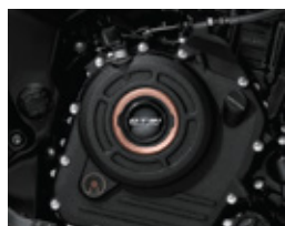
ENJIN SEJUKAN CECAIR 373 CC DOHC / LIQUID COOLED 373 CC DOHC ENGINE