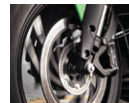
DUA SALURAN ABS / DUAL CHANNEL ABS